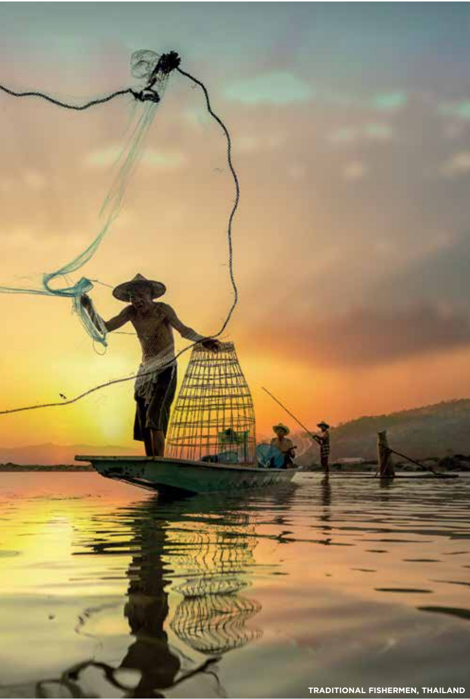
TRADITIONAL FISHERMEN, THAILAND