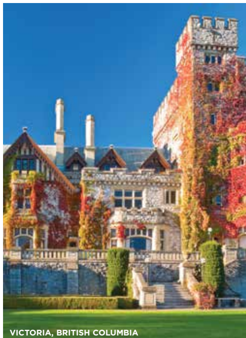
VICTORIA, BRITISH COLUMBIA

DEPARTS 13 APR 2024 DURATION 18 NIGHTS UP TO 47 EXCURSIONS