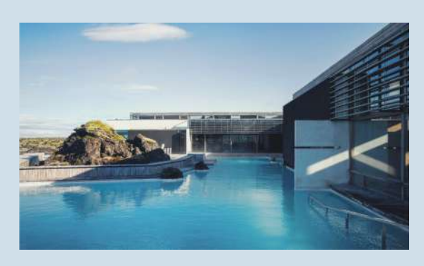
Silica Hotel 4*

"When I'm in a place like Iceland, I allow myself to take a little more time to divert off onto other paths creatively for a while and see what comes to me." -Damien Rice