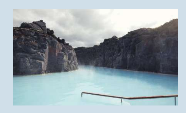
Retreat Hotel 5*

Soak in an exclusive experience at the 5* Retreat located at the Blue Lagoon. Your stay includes breakfast, entrance to the Blue Lagoon, unlimited entrance to the hotel's lagoon, daily yoga classes, daily guided hikes and more